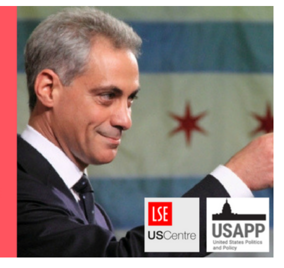
"Rahm Emanuel, Pointing, With Chicago Flag in Background"

On balance, we find that mayors are unlikely to seek higher office, and that most do not even express interest in doing so. Of the 695 mayors in our historical study, only 90 later ran for higher office (some multiple times), and only five percent of the total sample were ever elected to those offices. For comparison, previous studies have estimated that about forty percent of state legislators run for, or express interest in, higher office. Within this subset of mayors, there is significant variation of the specific offices sought. The most commonly sought office is governor, followed by the US House and then other statewide offices, such as lieutenant governor.